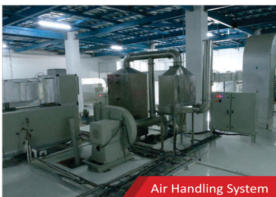
Air Handling System